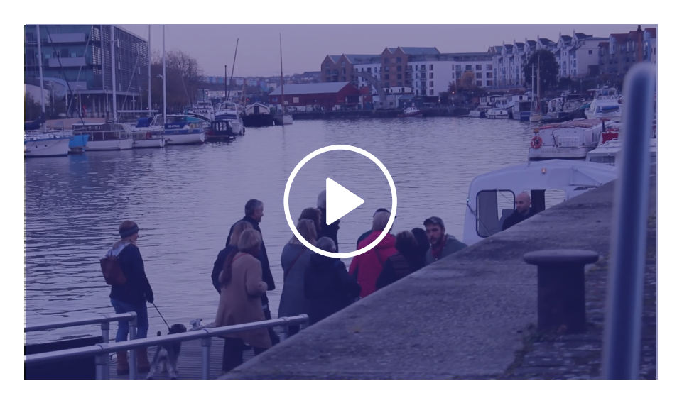
Video 4 Cary Comes Home 2018 promo.