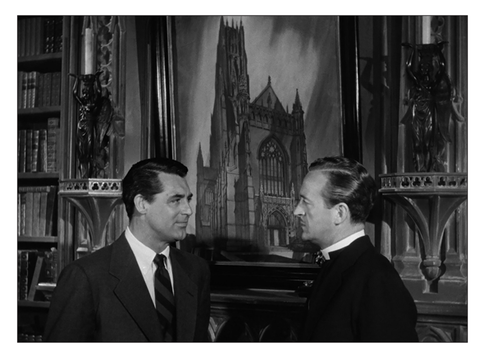
Figure 5 Cary Grant and David Niven in The Bishop's Wife (1947).