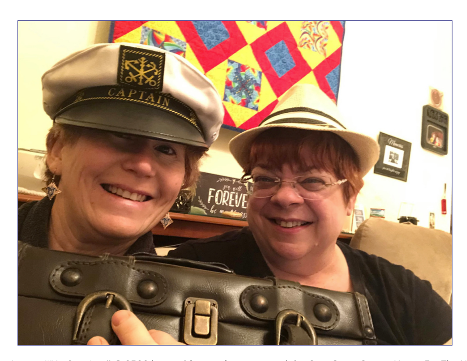
Figure 14 Facebook post: "Up & at 'em" @ 0500 hours this morning, to attend the Cary Grant Comes Home For The Weekend virtual Film Fest event commemorating Cary Grant's U.S. arrival! Welcome to America Archie!! #CaryNY100'.

Due to the pandemic, the fourth Cary Comes Home Festival (20–22 November 2020) took place entirely online using Crowdcast and Zoom to host illustrated talks, introductions to watch-along screenings, panel discussions and a Cary Grant quiz in partnership with Twentieth Century Flicks, Bristol's iconic video shop.<sup>23</sup> The festival developed the theme of journeys in a number of ways, not only celebrating Archie's emigration to the Big Apple in 1920, but also acknowledging other journeys of class and social mobility, identity and self-discovery. As part of this theme, the festival partnered with the Video Essay Podcast to invite video essays on the theme of The Journeys of Cary Grant (DiGravio 2020), which culminated in a panel discussion with the filmmakers live at the festival which was later aired as a podcast. Our gala film was An Affair to Remember (1957) which is set on a transatlantic cruise, but also explores several other kinds of mobility. This inspired the 'Love Affairs to Remember Marathon', which ended with a panel discussion with