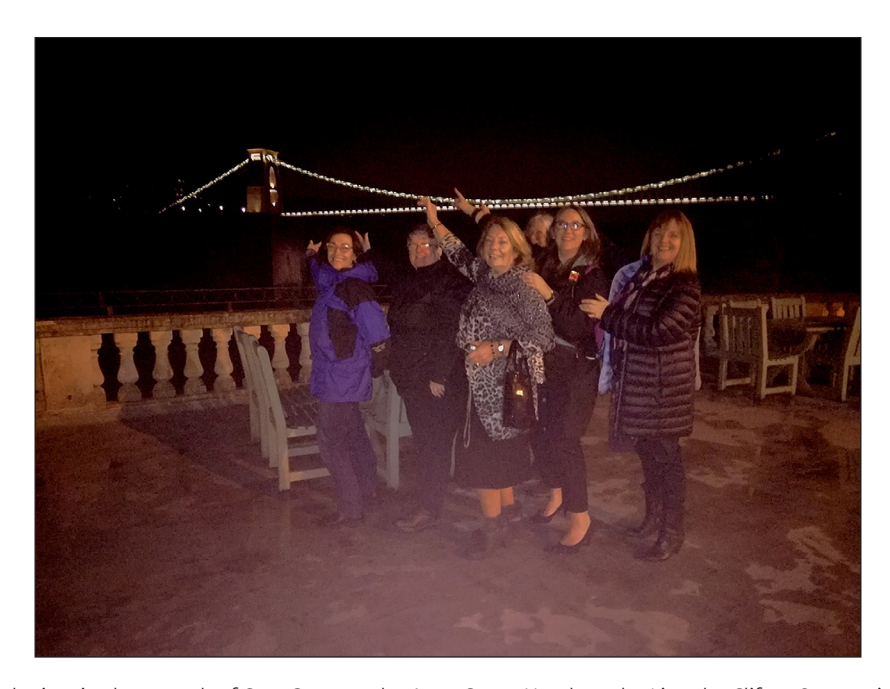
Figure 9 Recreating the iconic photograph of Cary Grant at the Avon Gorge Hotel overlooking the Clifton Suspension Bridge at Cary Comes Home 2018 © Charlotte Crofts 2018.<sup>18</sup>

Such recreations of an iconic celebrity image and the place where it is taken, Richard Howells argues, can take on religious significance as a site of fan pilgrimage because of the participants' 'physical connection with the person involved' (Howells 2011: 112, 128). The fan practice of rephotography becomes an act of devotion and 're-enacting and photographing at screen tourism locations' can be used to plan screen tourism destinations (Kim 2010: 60). This insight has informed our marketing of the festival using the #MakeThePilgrimage hashtag and encouraging people to take a #CaryGrantSelfie next to the Cary Grant statue (see Cary Comes Home Twitter (2020)) (see Figure 10).