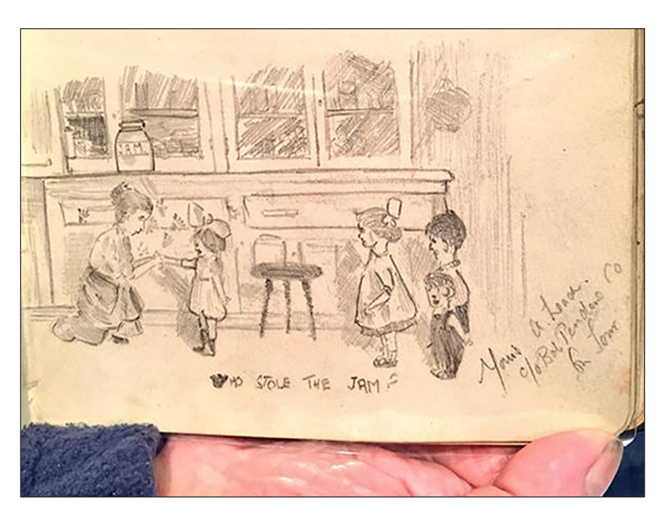
Figure 2 'Who Stole the Jam?' Sketch signed 'Yours A Leach, c/o Bob Pender Co.' shared at the 2014 Festival, © Charlotte Crofts 2014.

The 2,000-seater Hippodrome was a risky venue, not only expensive to hire but being a theatre, also lacking inbuilt screening facilities, which meant additional costs of projector, screen and PA hire, on top of the film licence. Our determination to work with the venue because of its compelling association with Cary Grant reveals a tension that has underpinned the festival: between the need to cover costs and the desire to curate his work in new ways. We also learned the difference between hiring a venue and working in partnership with one. When you share the box office, your venue partner has an incentive to drive ticket sales (as happened with Watershed); conversely when you hire a venue simply as a space (as with Bristol Hippodrome, run by national chain, the Ambassador Theatre Group), once they have your hire fee, there is no incentive to support the marketing and promotion.<sup>12</sup> However, we also