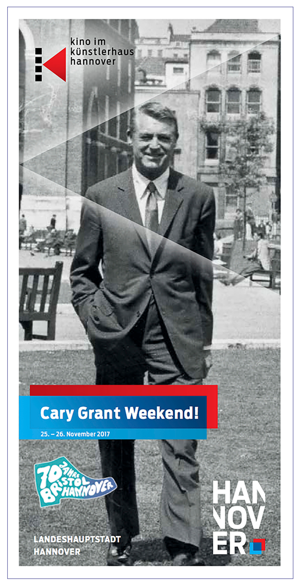
Figure 13 Brochure for the Cary Grant Weekend in Hannover.