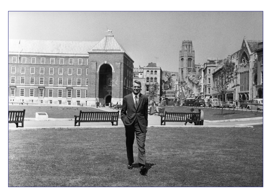
Figure 1 Cary Grant on College Green in the 1957, Bristol<sup>6</sup>

Similarly, de Valck applies Victor Turner's idea of 'communitas' to film festivals, arguing that they 'are