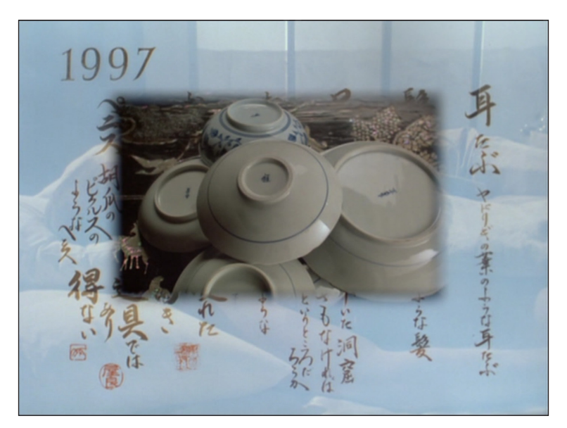
Figure 1: The dismembered intermedial frame in The Pillow Book (1996).

A Japanese writer and court lady to the Empress Teishi, Sei Shōnagon is most celebrated for The Pillow Book , which consists of poetry, instruction in rhetoric, gossip, and lists. It offers instruction in a number of courtly pursuits, including letter writing, extracts from which are quoted in Greenaway's film. The book records the quotidian and the fleeting, and has been subject to significant editorial interventions through the centuries; it was only set in print in the seventeenth century and exists in many different versions, each of which orders, comments on, and excises materials differently (see Keene, 1993). The exact details of Sei Shōnagon's birth and death, and even her given name, remain uncertain. Greenaway's earlier adaptation, Prospero's Books (1991), takes its inspiration from The Tempest by William Shakespeare, another