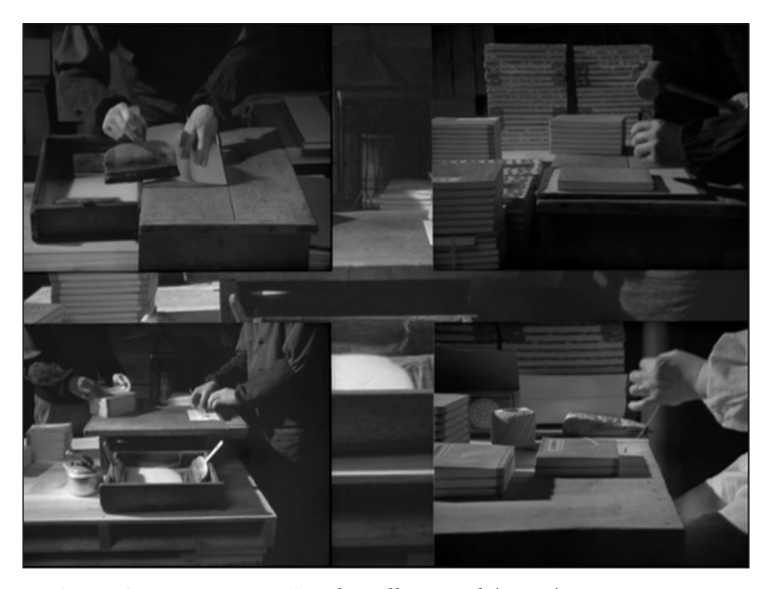
Figure 4: Discontinuous process in The Pillow Book (1996).

which a single event may be both back layer and top layer, the back layer both prioritised (as the largest single image) and effaced (by the images in front of it). There is simultaneity and separation, the rigidly demarcated frames keeping separate elements of the process together and apart, co-present on the screen but impossible to concentrate on in the same moment. The layered images operate as elaborate and erratic repetitions, and depth is a function of destabilising iterability, a mise-enabyme in which, Escher-like, simultaneity makes identity (across time and in space) impossible and absurd. The delinearising of process sees elements both preserved and abandoned in a Hegelian sublation through which they both remain the same and are changed. This depiction of bookbinding holds together as a sequence, but it also reveals the conventionally invisible strings that bind books and suture films. By rearranging the pieces of a sequence into the simultaneity of collage, this sequence exposes the 'madeness' of meaning and the ways in which narrative tells the world into order by omitting, excising, deemphasising, and censoring.