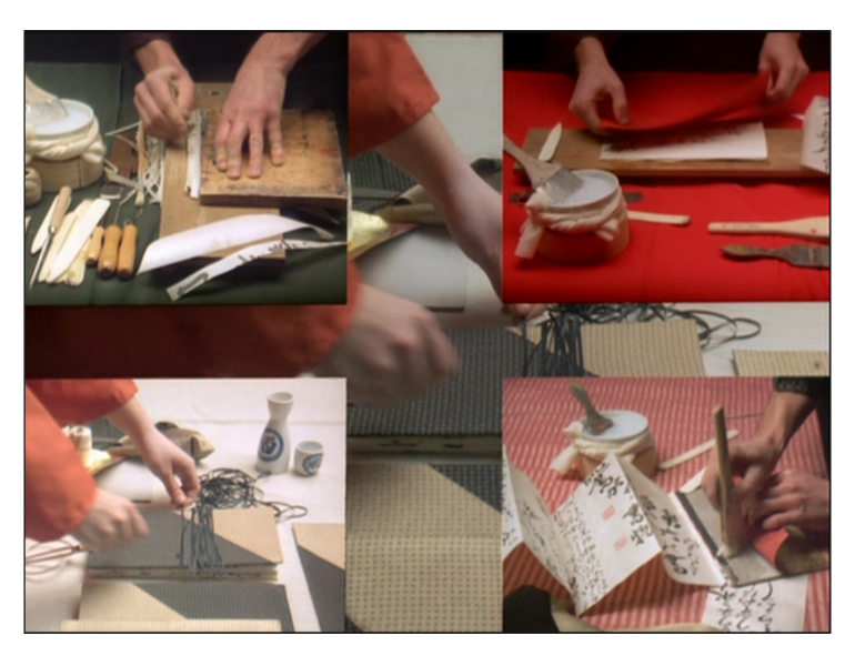
Figure 5: Re-membrance of obscene process in The Pillow Book (1996).

of the book fashioned from Jerome's flayed skin. This process throws the ontology of book into question: 'book' seems to signify bound pages, living skin, dead and dismembered skin, and the film itself. The tour de force sequence in which Jerome's skin is transformed into a book repeats the formal arrangement of the earlier bookbinding sequence (Figure 5). However, like all repetition, this iteration only almost duplicates its precursor. This time in lurid colour, with a key emphasis on reds, the process is synchronic, re-membering the earlier sequence from Nagiko's childhood. Even when paused, the sequence does not lose its momentum, its cornerplaced front layers pulling apart from one another, resisting a collective reading. Not only is this a grotesque sequence and the unacknowledged partner of the earlier (and then-innocent) sequence, it is also made impossible by concurrency; process becomes indeterminate if its linearity is amended to permit paradoxically simultaneous discrete positions. Jerome's skin exists in a state outside of the possibility of narration if it is being cut, cleansed, folded, glued, stitched, marked, and etched in the same moment. Robbed of its diachronic structure, this process makes images impossibly visible in the same moment while also burying in invisibility the remembered black and white images of bookbinding from earlier in the film which are both unrecognisable in this perverse retelling and persistently foundational.