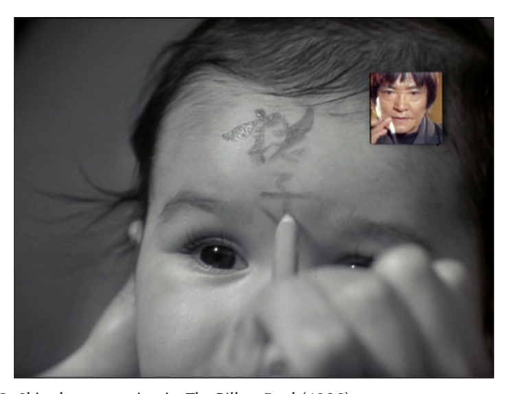
Figure 8: Skin deep meaning in The Pillow Book (1996).

The Pillow Book is a constant yoking of disparate terms in a vertical montage which, without the binding of narrative linearity, exposes the cuts which both sever and re-member the image. As the narrative ends, Nagiko writes on her baby's face, while an inserted front layer of her father (now in colour, both striking and jarring) hovers suspended, representing everything between Guardian Angel and vengeful fixation, between cathartic moving on and the relentless return of the traumatic repressed (Figure 8). The father does not mean deeply, he is, in effect, merely a mark on the baby's skin. Nor does the frame mean deeply. Character and the frame are performed as combinations of parts—skin deep, dismembered, and indigestible—which, in Gumbrecht's words, create an "aesthetic experience" [which] always provides us with certain feelings of intensity' and which move beyond 'interpretation and understanding.' (2004: 99) Intermedial films like The Pillow Book offer startling possibilities in the construction of an erotic cinema whose profundity lies in its