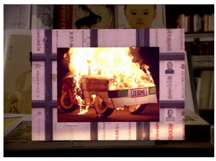
Figure 7: The almost sense of the dismembered frame in The Pillow Book (1996).

This inadequacy can be seen at work after Jerome's funeral, in the beautiful layering of superpositioned frames, which create an extraordinary almost-sense (Figure 7). The voiceover explains that the front layer is a burning effigy—a fake with direct signifying links to the original—of Jerome's car. The independently moving middle and back layers remain unexplained; they are, perhaps, pages from Nagiko's diary and the publisher's bookshelves. Before they can be explained or meaningfully combined, they fade. This lack of determined meaning does not diminish the effect of the sequence. The divided frame is discontinuous and discordant, and yet the layers form an aesthetic harmony with each other. The vertiginous simultaneity of the saturated frame—a frame in sympathy and at odds with itself—teeters on 'the verge